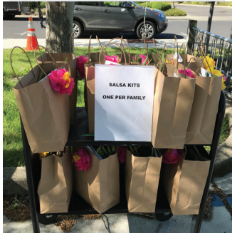
Make-at-home Salsa Kits.

Programs, materials and the extensive services provided at our Library would not be possible without the talented and dedicated staff. Their work and dedication make our Library a vital, relevant resource to our community. Even during the COVID-19 closure, Library staff was on hand to offer support through the new online chat feature or with a simple phone call. And when curbside pick-up became available in June, staff was there to make sure we all got our books and videos!