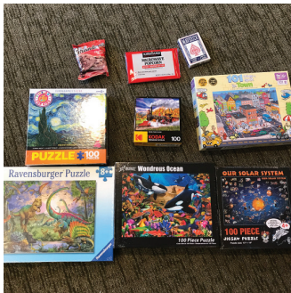
Screen-free activities for home.