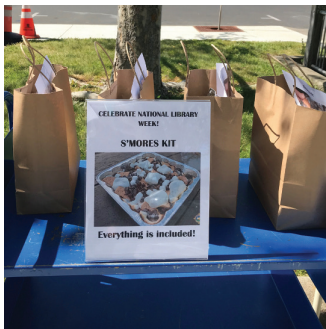
National Library Week S'mores Kit.