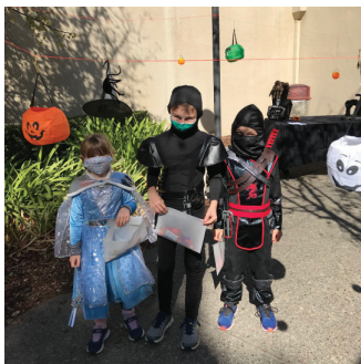
Halloween Outdoor Activities.